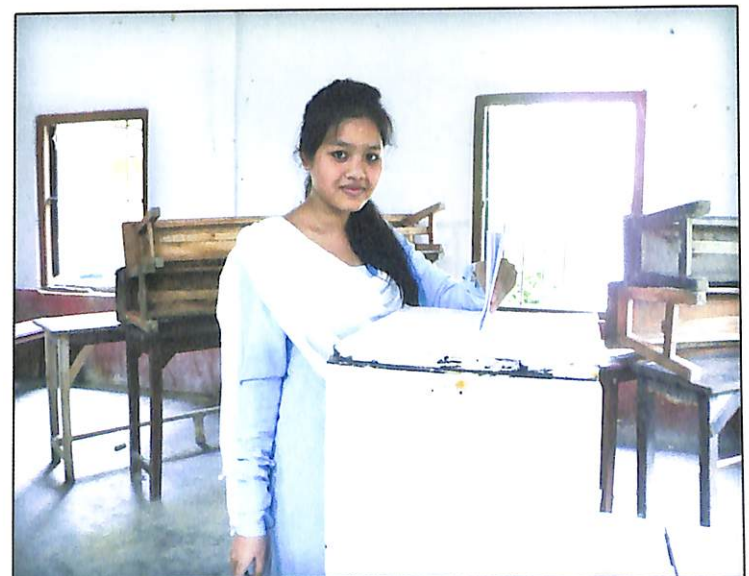
Vote Casting during the Students' Union Election