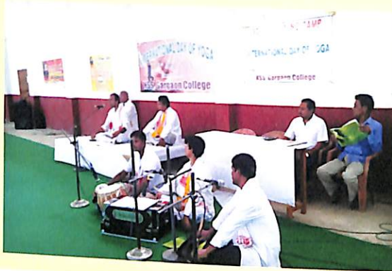
Yoga Training Camp on 20/06/2015 on the occasion of International Yoga Day on 21/06/2015 at Indoor Stadium, Gargaon College