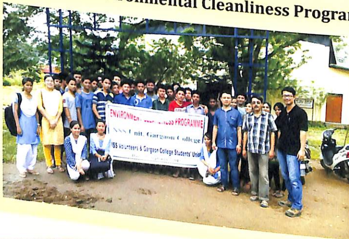
'Environmental Cleanliness Programme' was organized on 03/09/2015.